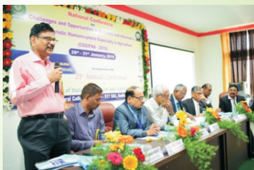
Keynote address being delivered during the 21st Annual Conference at Tirupati

the emerging areas of research in other sciences. Each such conference has a theme with many sub-themes. The deliberations during such conferences create opportunities for interaction between statisticians and subject matter specialists, who use statistics for their activities, which in turn open doors for collaborative studies for furtherance of science in emerging areas. The conferences are academically very enriching with very