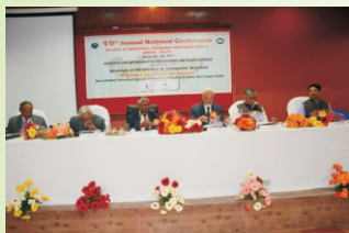
19th Annual Conference being held at SKUAST, Jammu

The society organizes annually in different parts of the country the national / International conferences, which