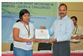
M.N. Das Memorial Young Scientist Award being given